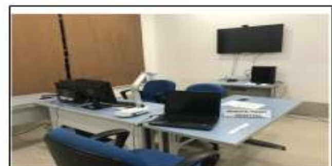
Figure 6: Remote point with VC equipment & Document visualizer