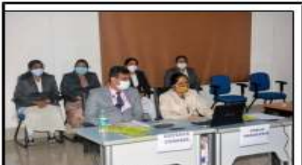
Figure 3: public prosecutor remote point