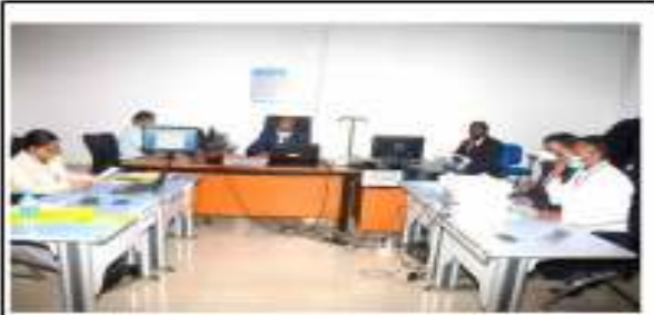
Figure 1: Court Point