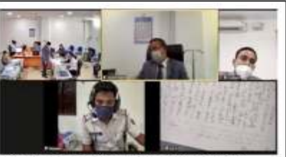
Figure 5: Marking of document using document Visualizer