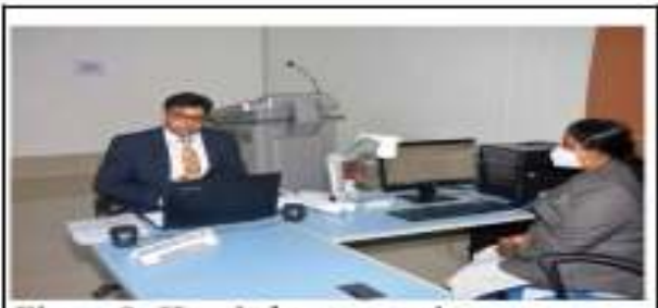
Figure 2: Hospital remote point