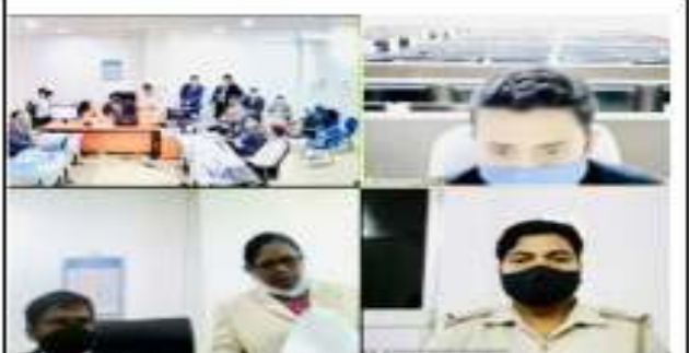
Figure 4: Examination of Police witness